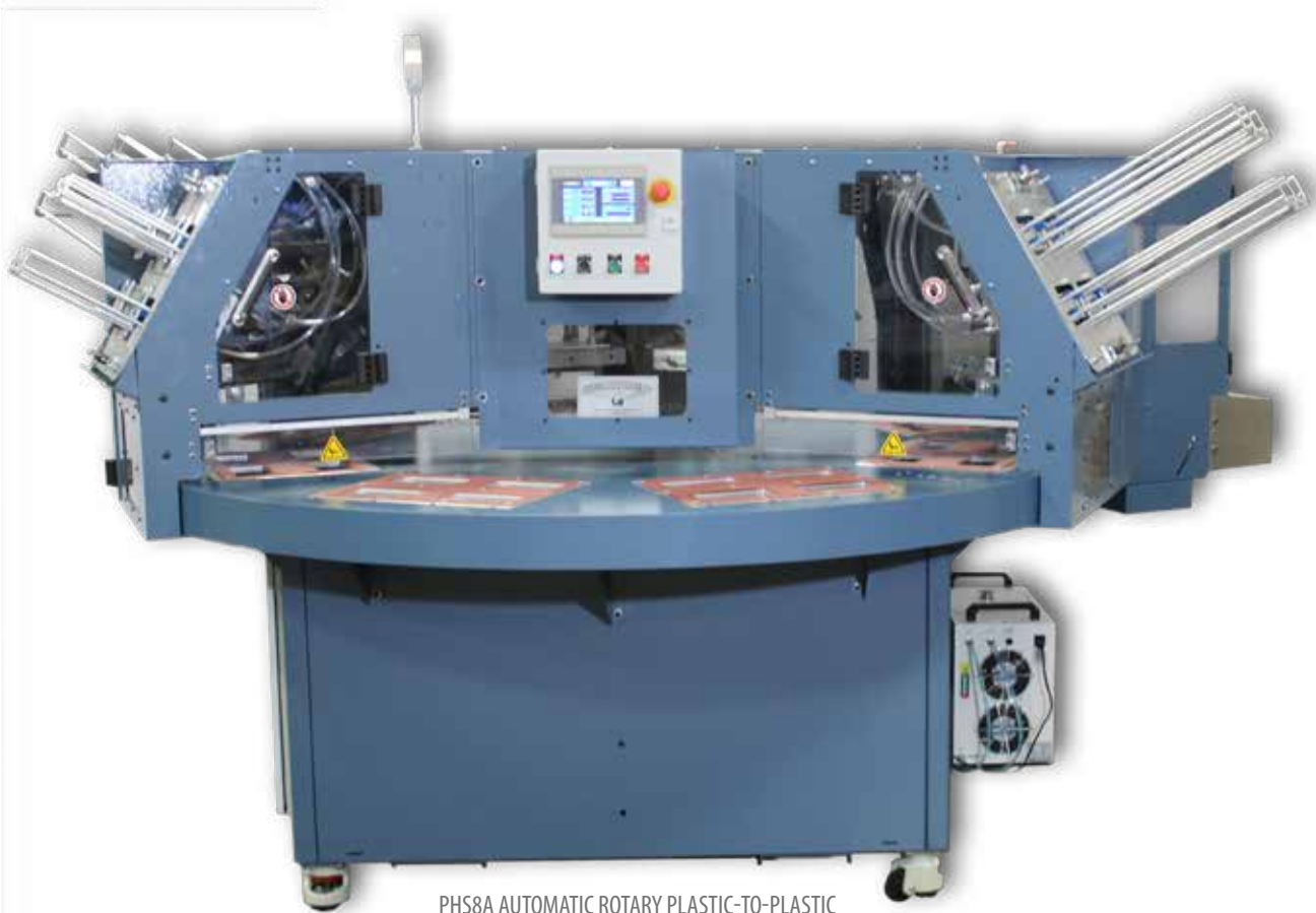
PHS8A AUTOMATIC ROTARY PLASTIC-TO-PLASTIC CLAMSHELL AND BLISTER SEALING MACHINE

EXPERIENCE the STARVIEW ADVANTAGE INNOVATIVE PACKAGING MACHINES