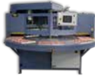
PH3 / PH6 / PH8

Click on miniature for more information about that series of Packaging Machines