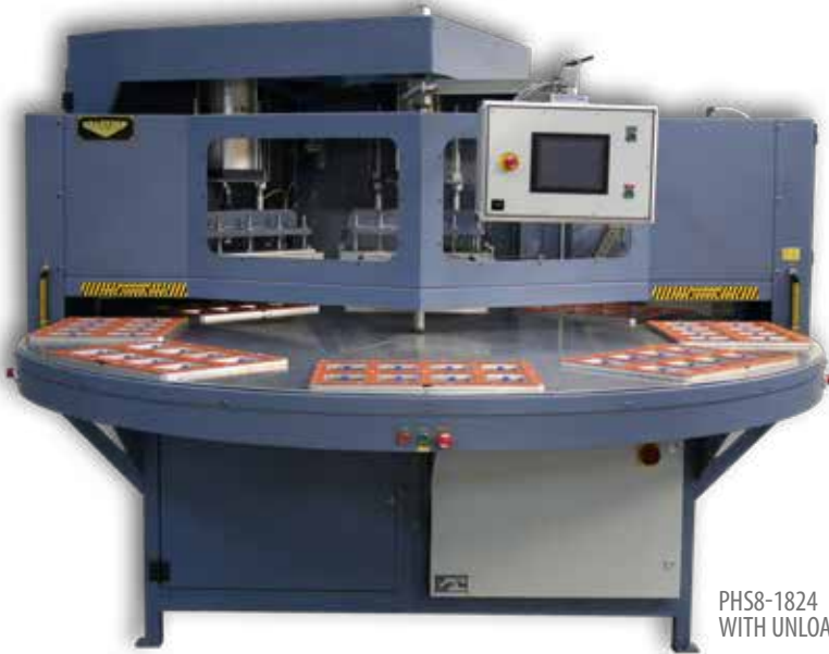
PHS8-1824 WITH UNLOADER