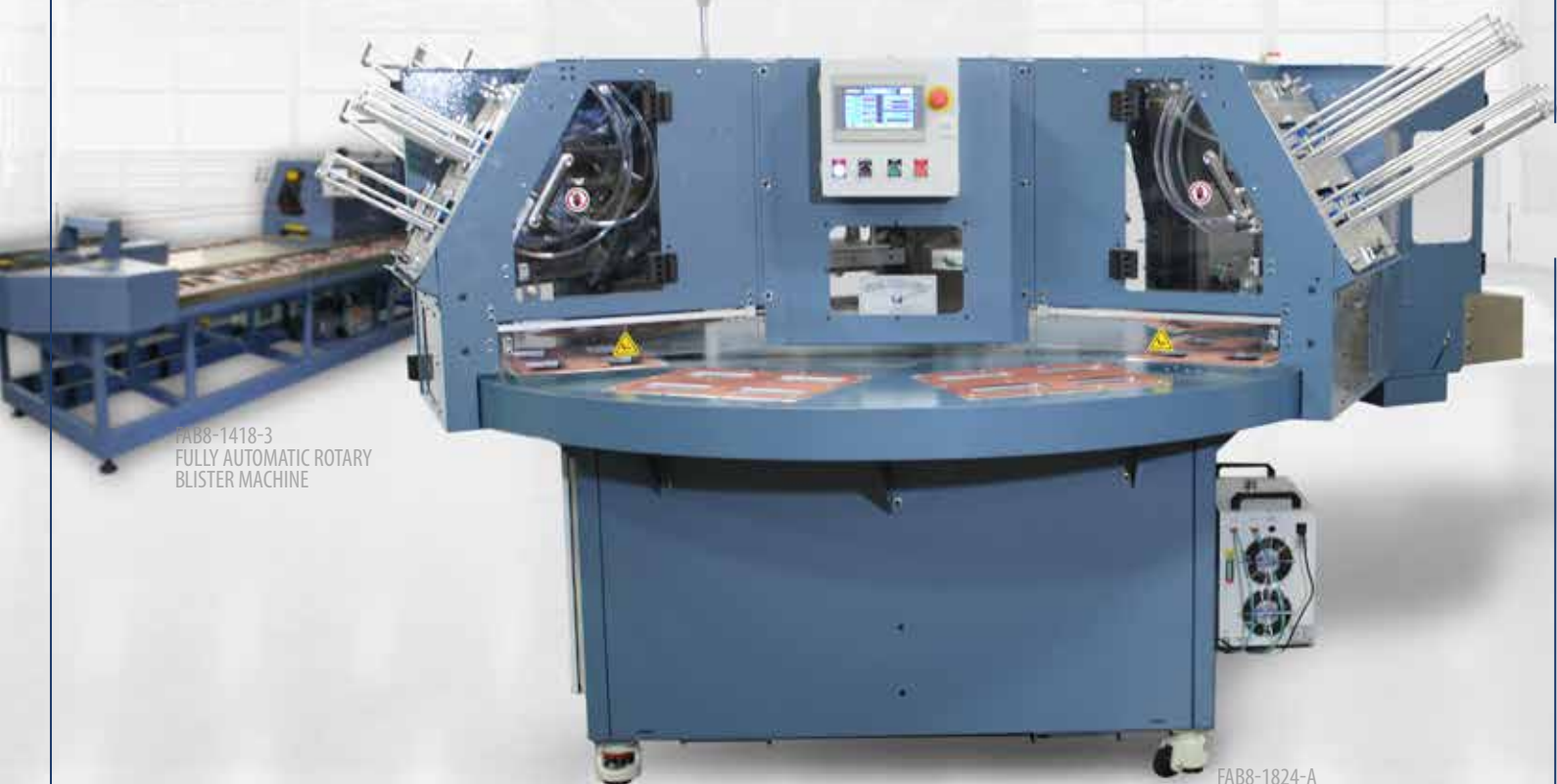
FAB8-1418-3 FULLY AUTOMATIC ROTARY BLISTER MACHINE

FROM SEMI-AUTOMATIC ROTARY TO FULLY AUTOMATIC INLINE PACKAGING MACHINES.